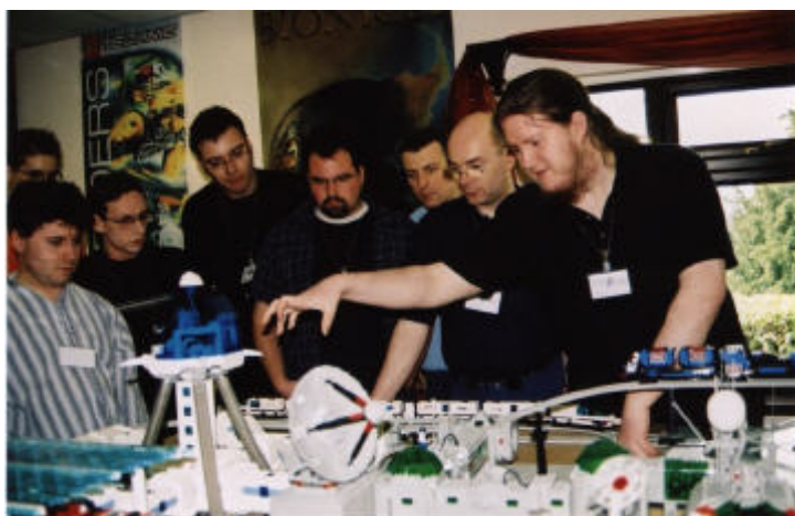
Moonbase discussions at the AGM